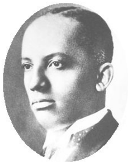
Carter G. Woodson 1875 - 1950